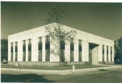
Concord Public Library 1940