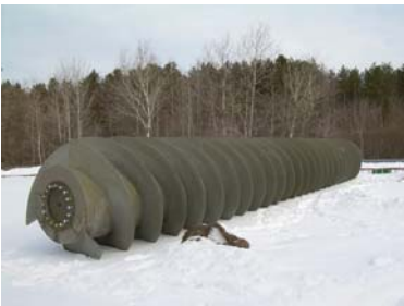
New influent screw pump

This week, a new influent screw pump, which will replace one of the three original influent screw pumps, was delivered to the Hall Street Wastewater Treatment Facility. The fifty foot long, six foot wide screw will be installed in the spring. Spring installation allows for a $15,000 reduction in installation costs due to the better weather. Having the equipment on-site early allows for expedited installation, should one of the remaining pumps fail in the interim.