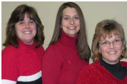
Library, Collections, and Personnel staff on Wear Red Day